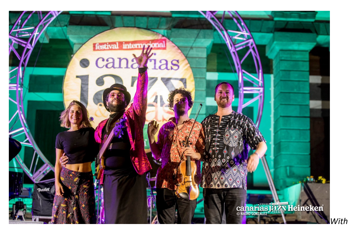
Munir Hossn @ Canarias Jazz y Mas, Gran Canaria, Spain